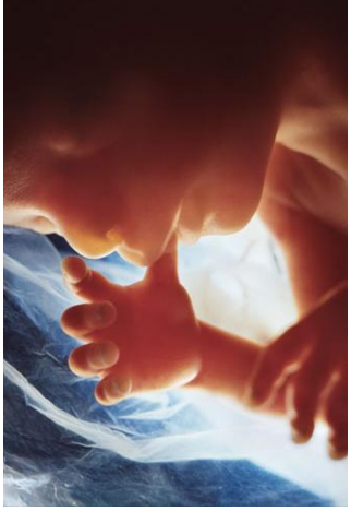
All rights reserved. Photos are reproduced under "fair use" terms for the purpose of education only.