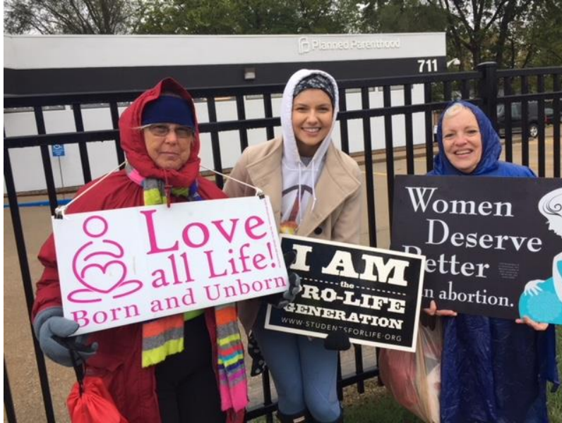
Jeff City joins Students for Life on the rainy day!

Despite the rain, the sidewalk was full most of the day. Just received a text from Mary "Over 25 folks have shown up to pray today!" and it is only 11am! We will need you next week!